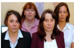
The Rape Crisis Centre staff & volunteer team

The Rape Crisis & Sexual Abuse Centre was the first voluntary organization in Northern Ireland to provide services for adult women who had been subjected to rape or other forms of sexual violence and assault and to adult survivors of childhood sexual abuse.